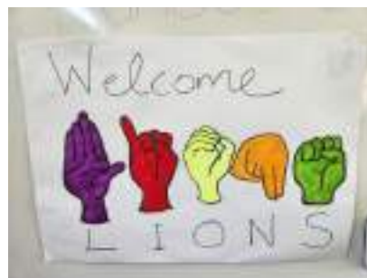
A visit and service project at Holy Family School for the Deaf.