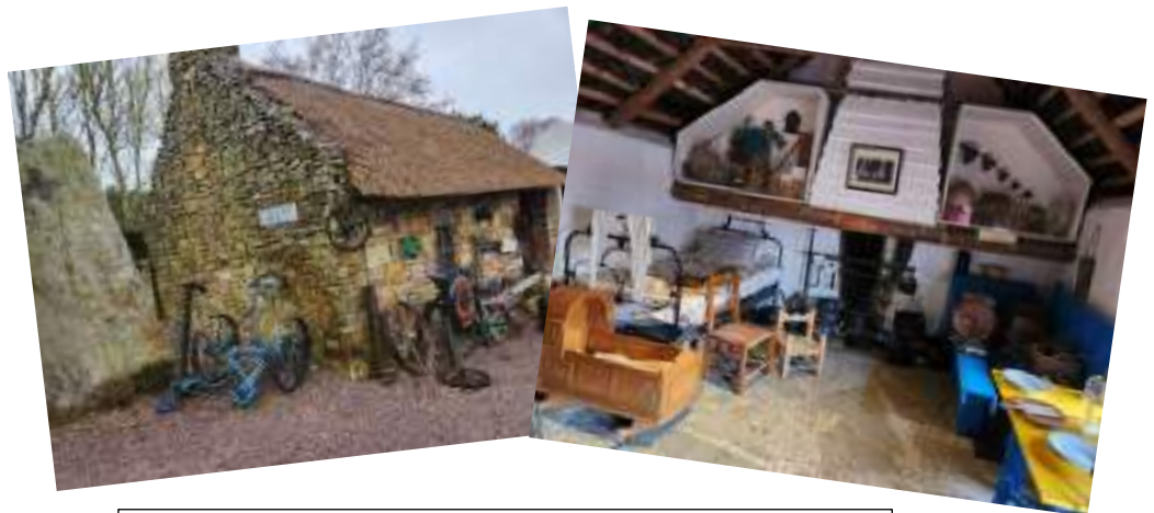
In stark contrast, we visited these old, restored Irish farm houses.