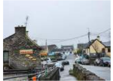
Actress Maureen O'Hara hung out in the picturesque village of Sneem when not in Hollywood.