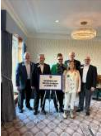
My colleagues from the International Membership Development committee