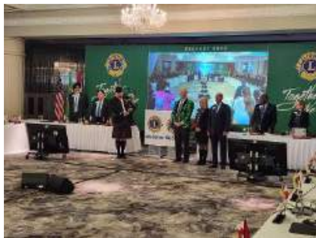
Opening ceremony at the Belfast International Board Meeting.