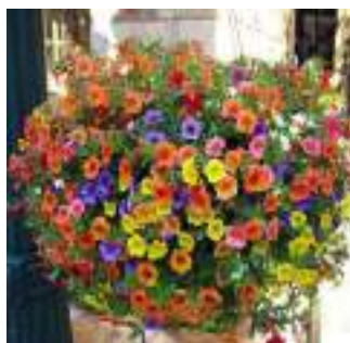
Million Bells/Calibrachoa Purple, Blue, Light Blue, Yellow, Pink, White, and combinations