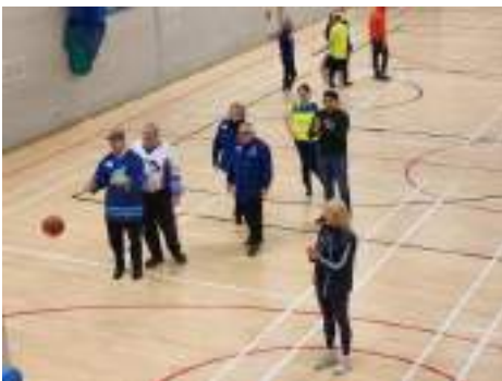
Board Members playing basketball with Special Olympians in Killarney.