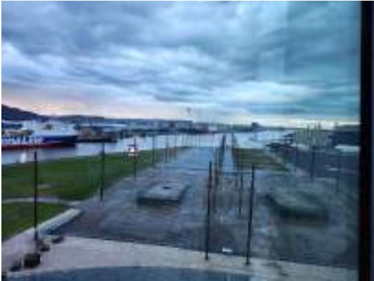
The dock, in Belfast, where the Titanic was built.