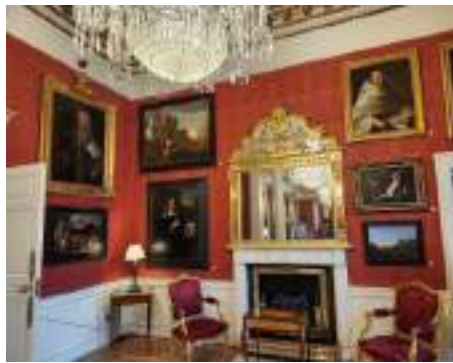
The majestic Dublin Castle, inside and out!