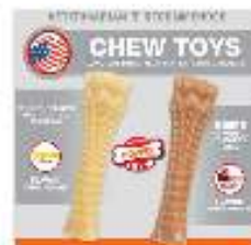
Nylabone Chew Toys

Both come in a variety of sizes and colors