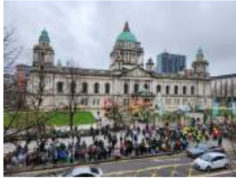
Above, scenes from the Belfast parade. To the right, the wall that divides the Catholic and Protestant neighborhoods of Belfast.