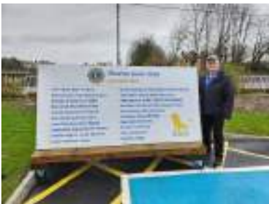
We had the opportunity to visit with the very active and committed Lions of Thurle.