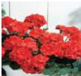
Geraniums Red or Pink

This year we have decided, with our supplier, that we will open online sales to anyone who would like to purchase baskets this year. With Mother's Day on the 14 th of May it is a good time to remember her or any loved one with the gift of Flowers. It is time to cheer up and put a smile on with a taste of Spring. The following is a list of baskets that will be available.