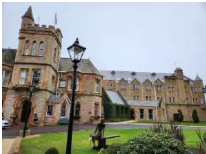
Cullodeen Resort, where we met (and stayed) in Belfast.

Before departing Dublin, time was set aside for seeing this historic city and we chose to spend most of our free day touring Dublin Castle, the administrative center of British rule from 1200s to 1922. Today it is used by the President of Ireland for public ceremonies. During our long flight home, we were still pumped up from witnessing all of the good works done by the Lions of Ireland and how the Lions Clubs International Foundation supports our mission of helping those in need globally.