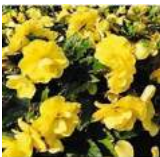
Non-Stop Begonias Yellow