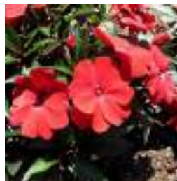
New Guinea Impatiens Pink, Salmon, Red