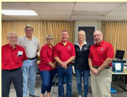
Kent Lions in Walls Elementary School for vision screening.

The Kent Lions Club is back to vision screening in the Kent schools, something that hasn't been allowed since 2019 due to covid. To date they have screened on 7 days in 5 different schools, a total of 623 students resulting in 73 referrals. There are 6 more days scheduled in 6 different schools, including 3 schools in Ravenna where Kent and Brimfield Lions will assist the Ravenna Lions Club .