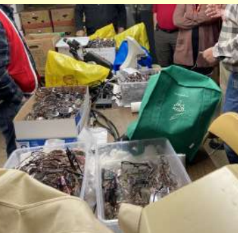
Some of the thousands of pairs of glasses donated to the Lions in communities across NE Ohio.