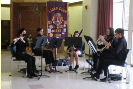
December 2 - Woodwind Quintet

Kent Lions Club celebrated the holidays with performances by two musical groups from Kent Roosevelt High School at their December noon meetings.