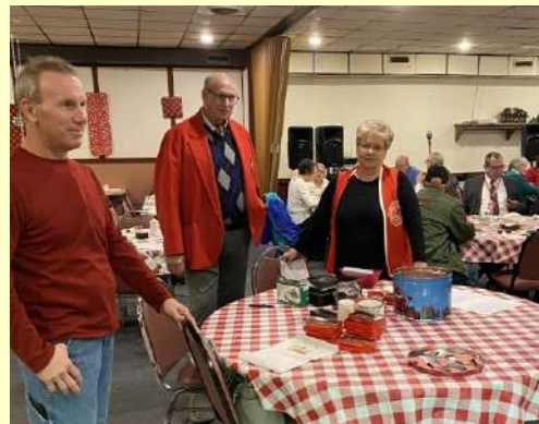
Check-in, door prizes and lottery tickets.