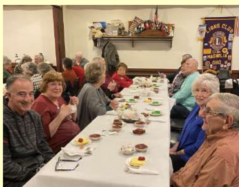
A few of the many happy diners.