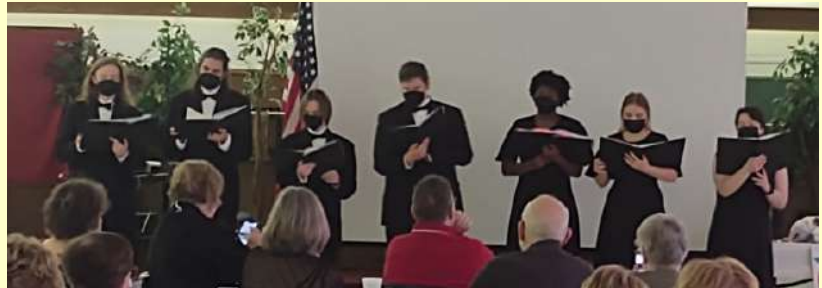
December 16 - 8 Aces Choral Group