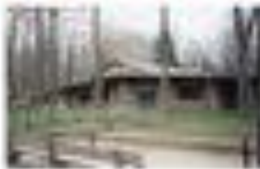
CHESTERLAND LIONS CLUB BUILDING, 4000 W. 100th AVE., CHESTERLAND, OH 43004

Raffle format will be to draw 5 numbers only