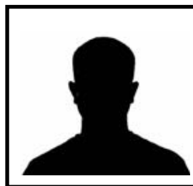
Open First Vice District Governor