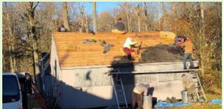
Cabin renovations have already started.

Once complete, Camp Ho Mita Koda will begin hosting programs year-round which has never been done in its 92-year history. That in turn will help to expand their reach, service, and support to more participants on an annual basis, while providing rental opportunities to the community, the release stated.