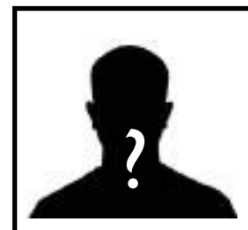
Open Second Vice District Governor