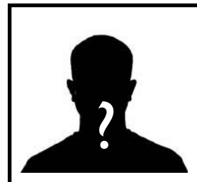
Open Second Vice District Governor