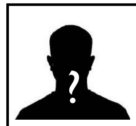
Open Second Vice District Governor