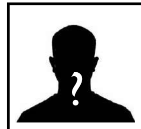
Open Second Vice District Governor