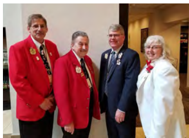
The District Governors of the Ohio Lions MD13